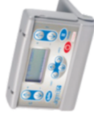
ARTROSTIM FOCUS PLUS